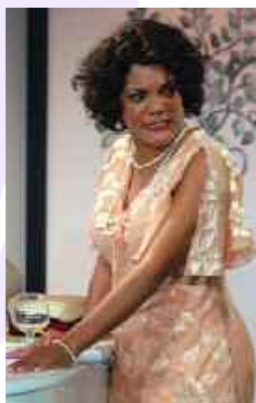
Rough Crossing, Lolita-Marie